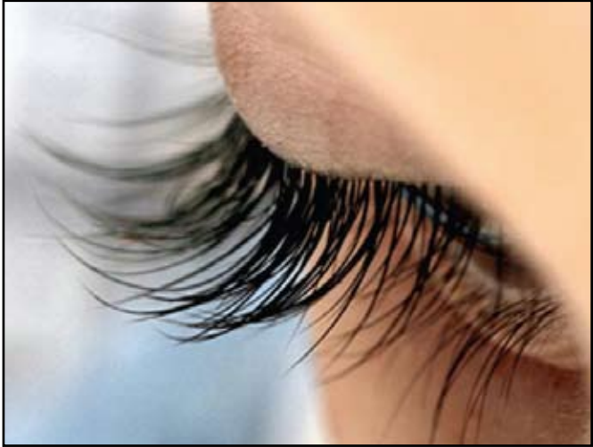
Longer, thicker, darker lashes!

In late December the FDA cleared Latisse™ for increasing the growth of eyelashes, making them longer, thicker and darker. This product really works! The drug was originally FDA cleared for glaucoma and then it was discovered that it grew eyelashes. A simple daily treatment using disposable applicators is now available for home use. Latisse™ can be purchased from us or you may take an Rx to the pharmacy of your choice.