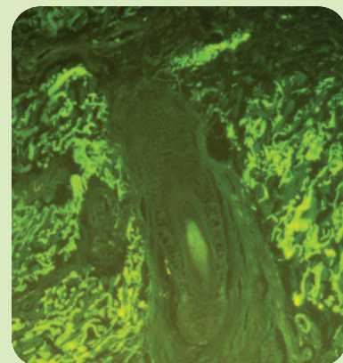
Reduced MMP Activity Post-Tx