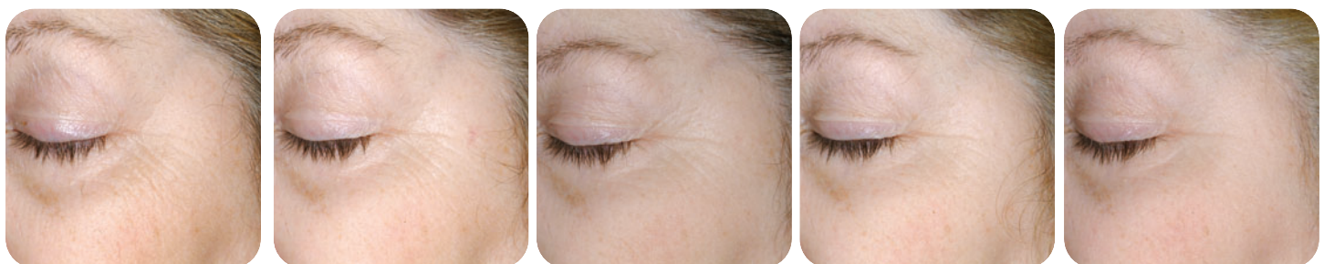
Pre, 1, 8, 16, 24 weeks post GentleWaves LED Tx